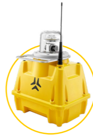
UP TO 80 PORTABLE LED LIGHTS