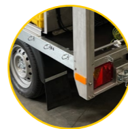
COMPLIANT WITH ROAD TRANSPORT REGULATIONS