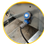
110-230VAC ELECTRICAL CONNECTION